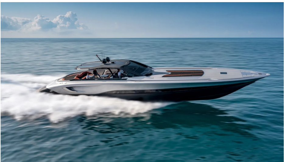
Bolide 80 Superyacht by Victory Design

The inaugural series of Palagano Leather Tempus Fugit Watch will be an extremely limited edition to mark the launch of Bolide 80, the world's fastest superyacht, conceived, designed and built entirely in Italy by Victory Design.